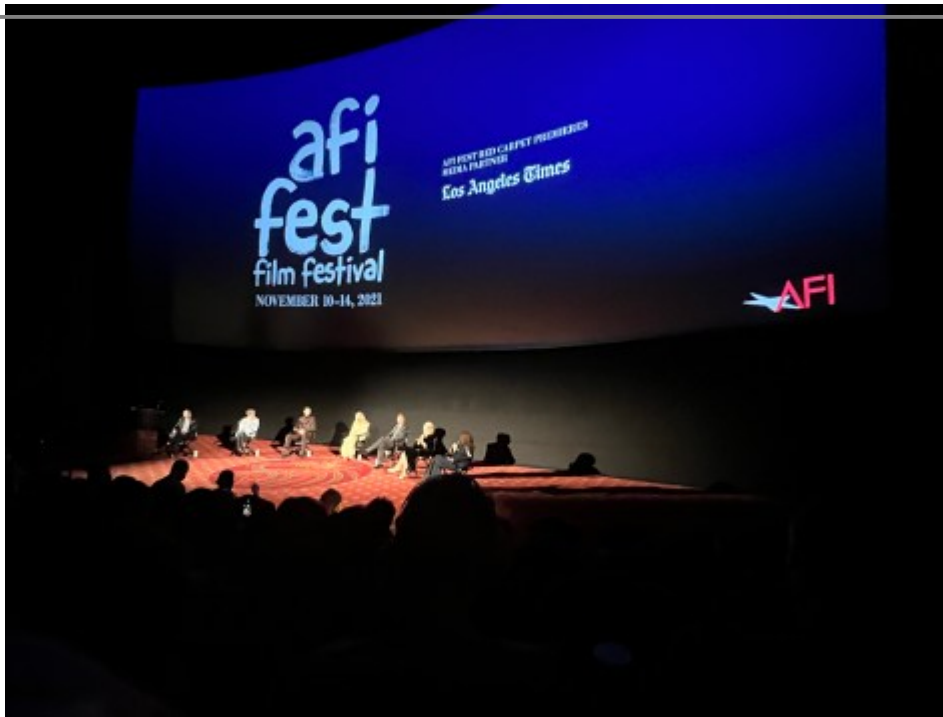
Q &amp; A, on

November 11th, 2021, following the screening of The Power of the Dog , inside Hollywood's TCL Chinese Theatre.