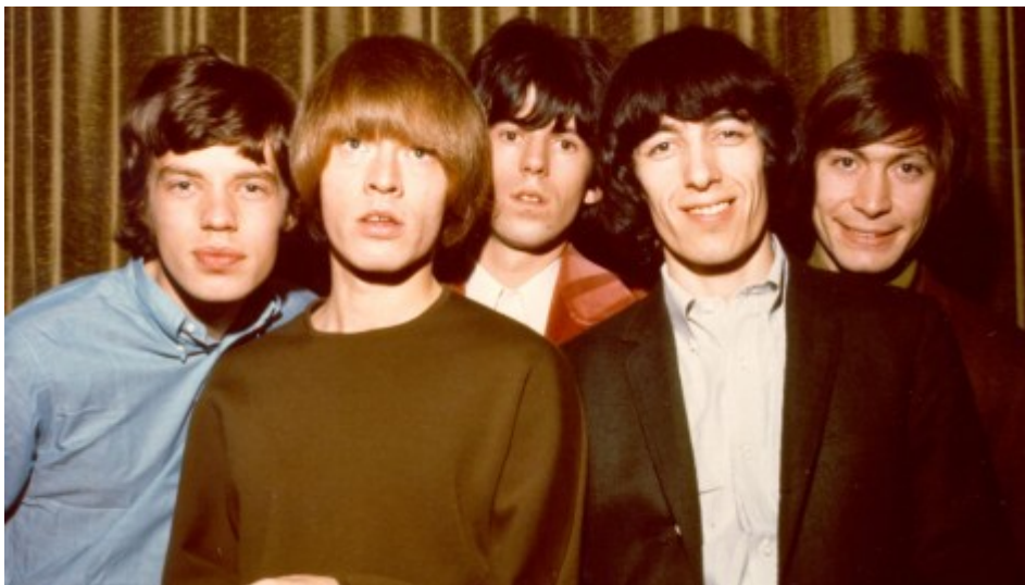
The Stones and Brian Jones