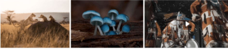
Karibu Nyumbani, Fungi: Web of Life, Indigenous Resistance: Now and Then

adolescence and uncover the fascinating disparities in the experiences of teenage boys and girls.