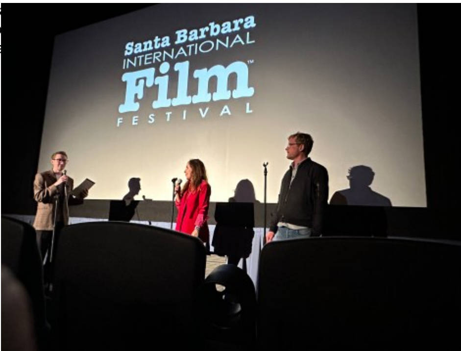
SBIFF Q&A with