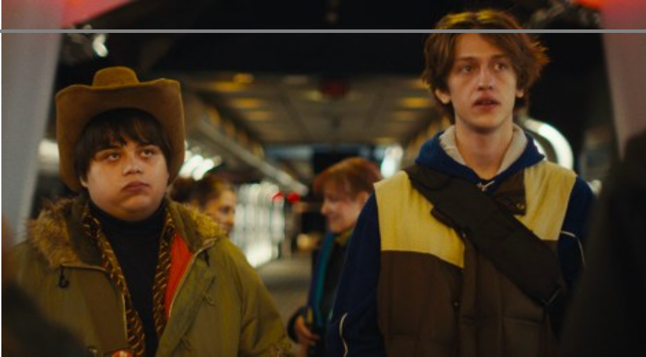
I Like Movies