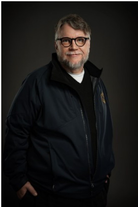
Frankenstein. Writer/Director/Producer Guillermo del Toro of Frankenstein.

Canva is the exclusive Presenting Sponsor of AFI FEST. FIJI Water is the festival’s Official Water Sponsor.