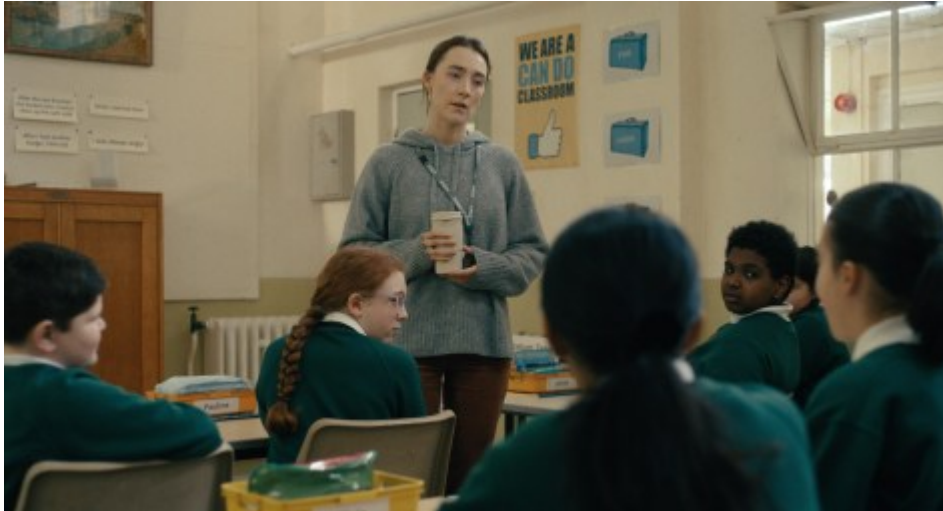
Special Screenings section, BAD APPLES

26 with the World Premiere of SONG SUNG BLUE. Gala Screenings include JAY KELLY on Thursday, October 23, NUREMBERG on Friday, October 24, DEAD MAN'S WIRE on the afternoon of Saturday, October 25, and CHRISTY on the evening of Saturday, October 25 and the World Premiere of THE SPONGEBOB MOVIE: SEARCH FOR SQUAREPANTS on the afternoon of Sunday, October 26.