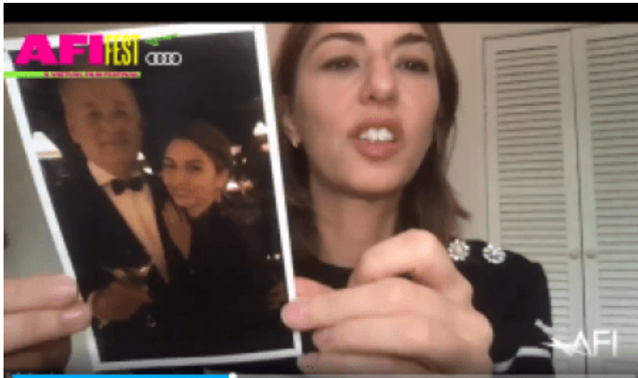
Sofia Coppola shares a photo during her 2020 AFI FEST Tribute