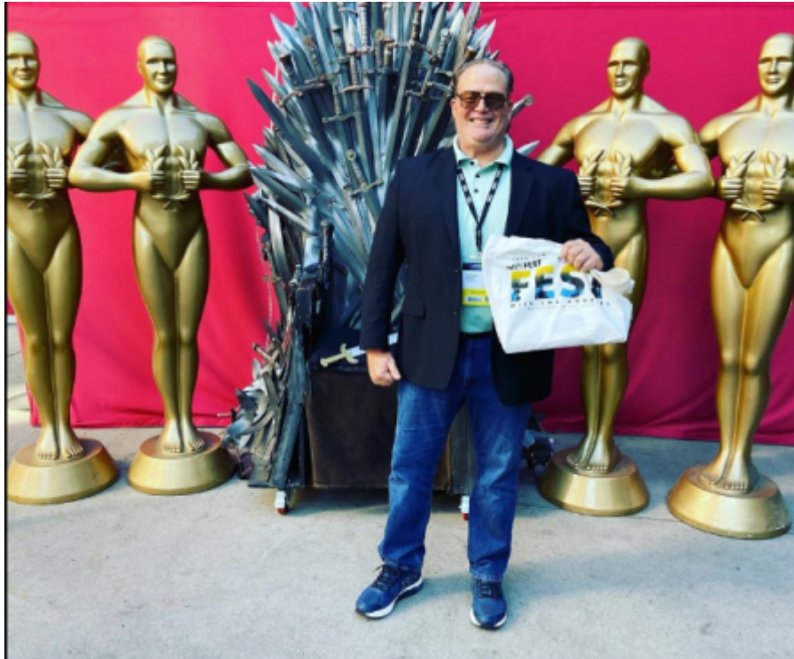
HollywoodGlee celebrating the start of the 2019 AFI FEST presented by Audi.