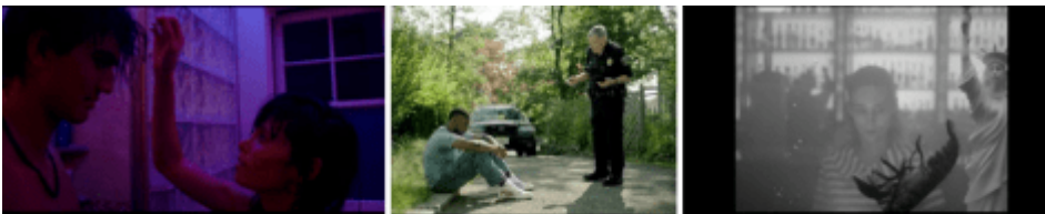
Chaperone, Grassland, La Cocina