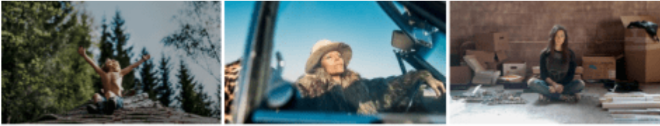
A New Kind of Wilderness, Linda Perry: Let It Die Here, Resynator