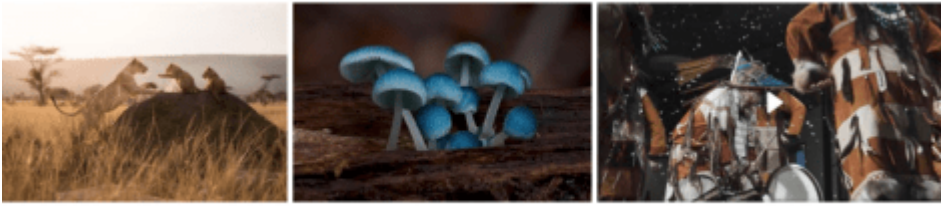
Karibu Nyumbani, Fungi: Web of Life, Indigenous Resistance: Now and Then