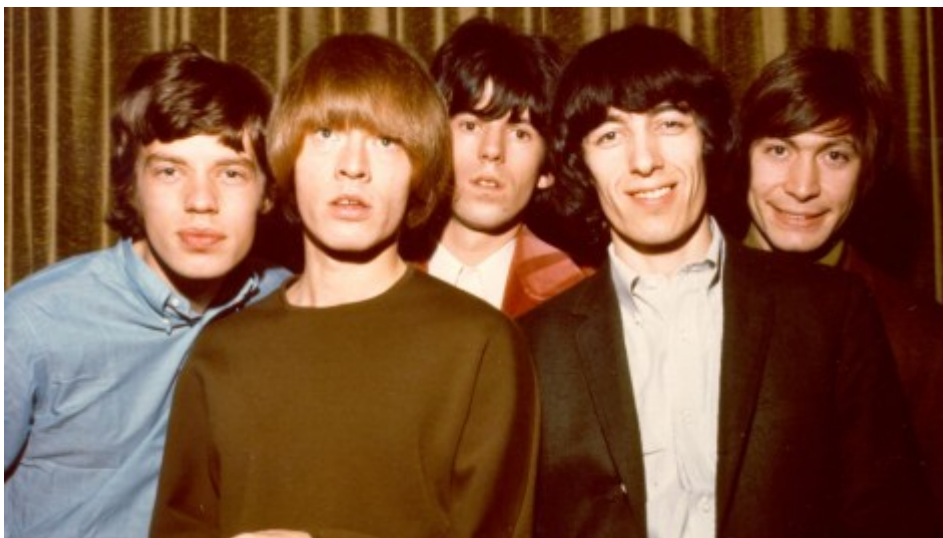
The Stones and Brian Jones