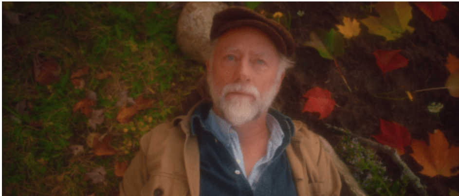
Xander Berkeley in Alchemy of the Spirit