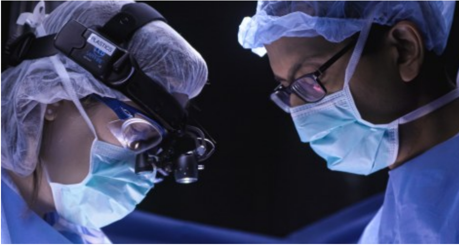
Doctors working.