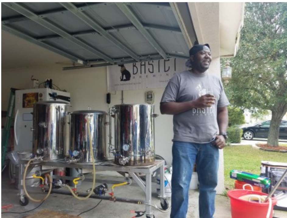
Huston Lett Bastet Brewing.

ONE PINT AT A TIME directed by Aaron Hose. Craft beer generates tens of billions of dollars annually for the US economy. Despite beer's Egyptian and African heritage, these traditions have been mostly forgotten and are rarely found in American brewing culture. Today, Black-owned breweries make up less than 1% of the nearly 9,000 breweries in operation in the United States. Eager to shift the historical perception of who makes and drinks beer, Black brewers, brand owners, and influencers across the country are reshaping the craft beer industry and the future of America's favorite adult beverage. Thrillist said, ONE PINT AT A TIME was "an invaluable and visually captivating spotlight on the adversities of Black Americans realizing their dreams to own a brewery."