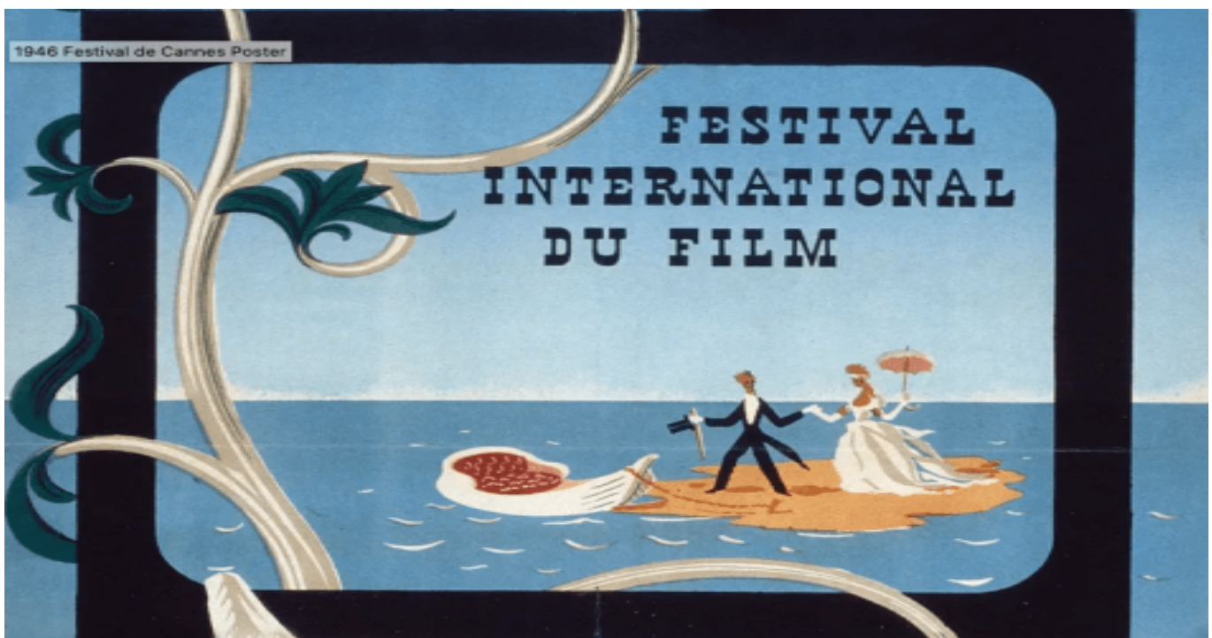
1946 Festival de Cannes Poster © Leblanc

At the start of the 21 st century, Cannes was the premier cinema event in the world. It stood out from the other international film festivals events such as the Berlinale and Venice festivals.