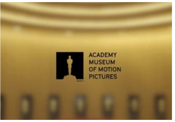
The Academy Museum

Stay tuned and please check out the sponsors!