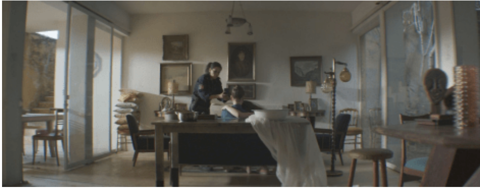
Robe of Gems