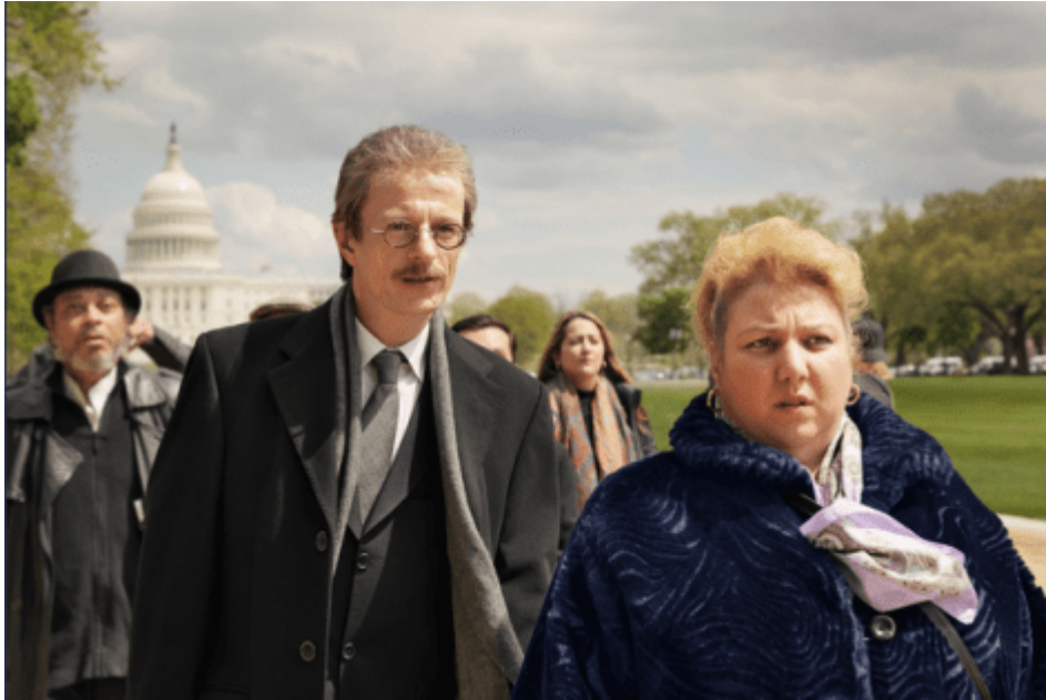
Alexander Scheer, Meltem Kaptan in Andreas Dresen's Rabiye Kurnaz vs. George W. Bush

Meltem Kaptan in Rabiye Kurnaz vs. George W. Bush by Andreas Dresen