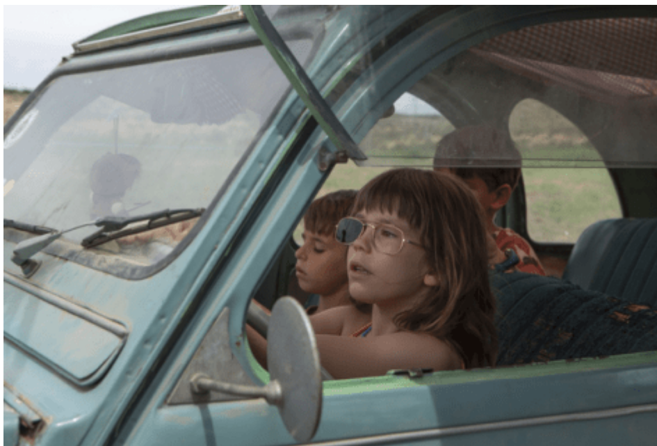
Alcarràs © Lluís Tudela