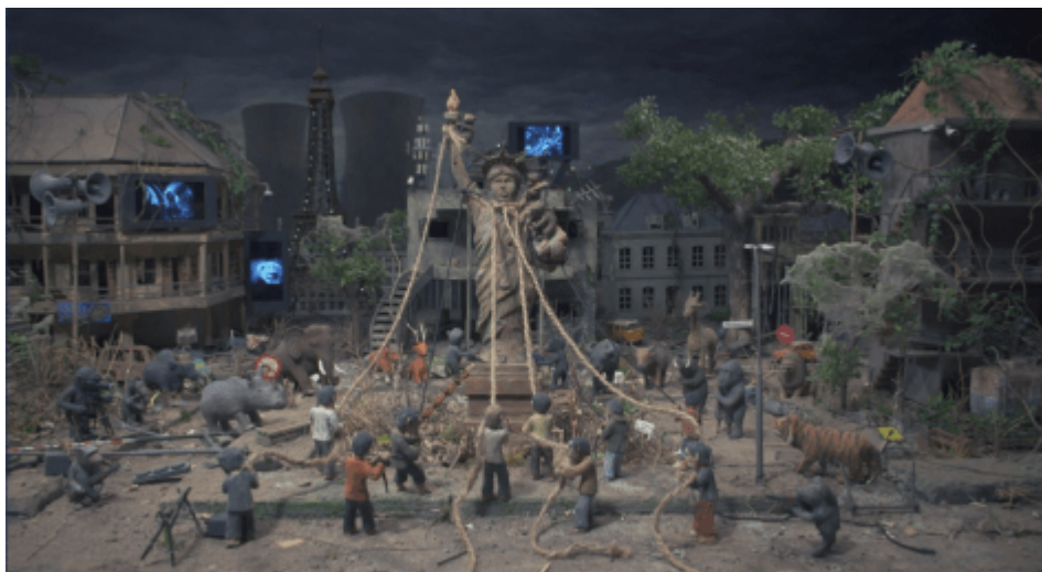
Everything Will Be Ok by Rithy Panh