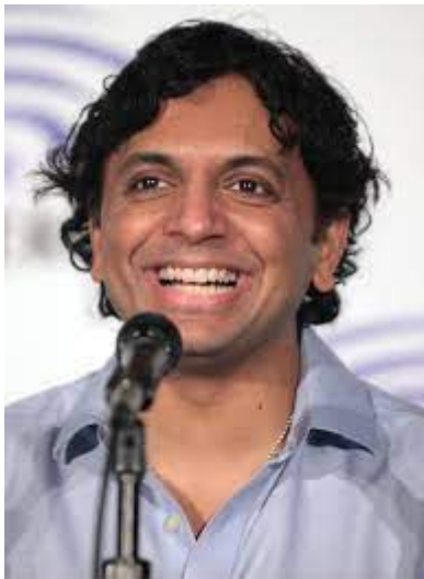
M. Night Shyamalan