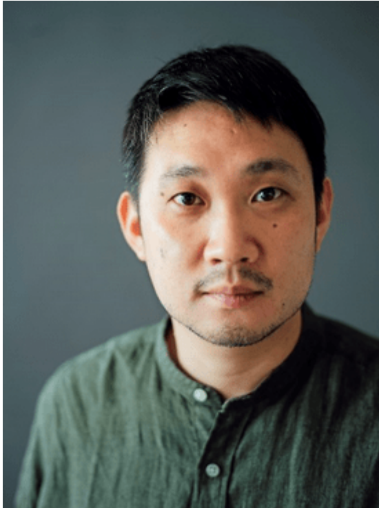
Ryûsuke Hamaguchi @Berlinale