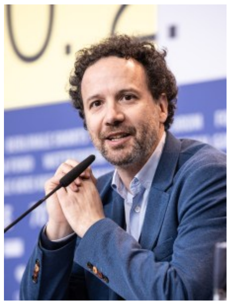
Artistic Director Carlo Chatrian.

Each selected film aims to engage in a conversation, not only with the audience, but also with the other films. Some of the conversations the selected films offer are the dialogue between two old artists or the one between past and present times. A dialogue with sign language and the special connection between two people excluded from "normal life". The inner communication between twins and the metacommunication between a book and its readers a century after. The dialectic in place between owners and workers and the dichotomy between truth and lies.