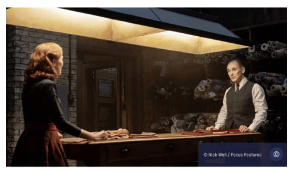
Zoey Deutch and Mark Rylance in The Outfit by Graham Moore

The Berlinale Special program comprises 15 films from 12 countries – six documentaries and nine feature films, among them two short films. 12 films are world premieres. Most of the Berlinale Special Gala films work within genre – spanning from horror to musical, from fantasy to gangster movie. Berlinale Special will show mainly documentary forms. In its line-up, the Berlinale Special combines celebrity sparkle with the stories that matter.