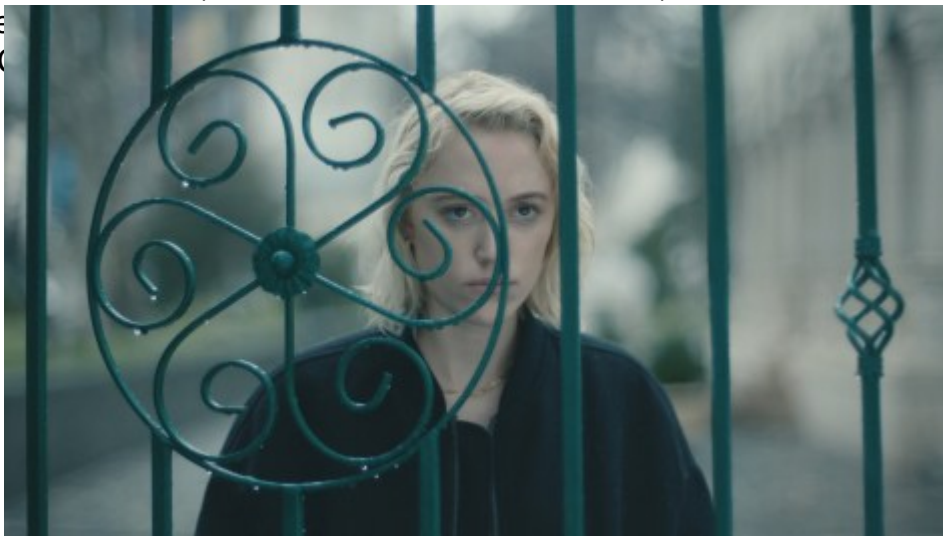
Maika Monroe appears