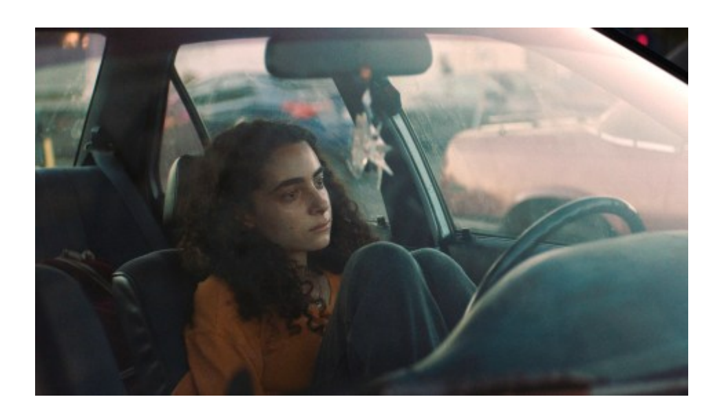
ARE YOU STILL THERE?

Virtual screening available beginning November 11, 12:00 p.m. PST | Buy Virtual Ticket(s)