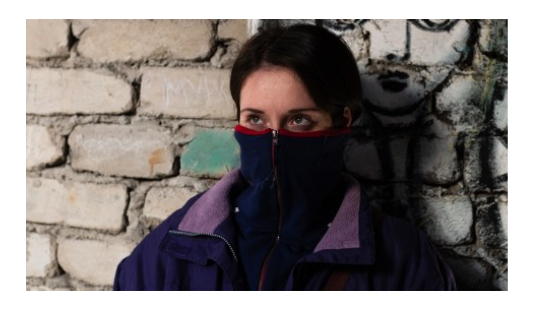
UNCLENCHING THE FISTS (RAZZHIMAYA KULAKI)

Virtual screening available beginning November 11, 12:00 p.m. PST | Buy Virtual Ticket(s)