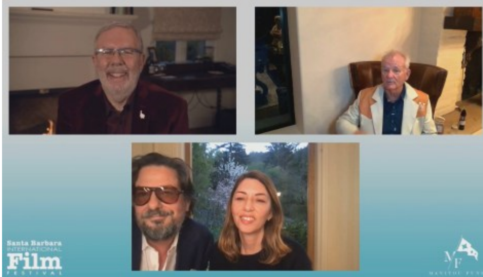
Roman Coppola, lower left, with sister Sofia Coppola, lower right, presented Bill Murray, upper right

During Murray's conversation with Maltin, guests enjoyed nostalgic clips of his film career, including Caddyshack , Ghostbusters , Groundhog Day , Rushmore , The Royal Tenenbaums , Lost in Translation , St. Vincent , On the Rocks , and more.