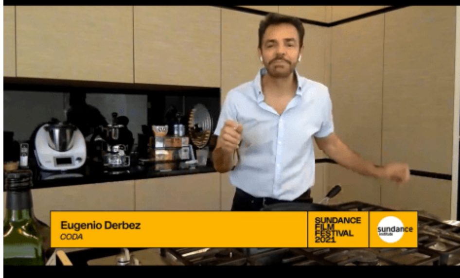
CODA Filmmaker Eugenio Derbez shares his breakfast culinary skills as part of the Sundance Dailies at the Sundance Film Festival on January 30th, 2021.

Breakfast with... Festival Director Tabitha Jackson. Derbez showcased his cooking skills as well.