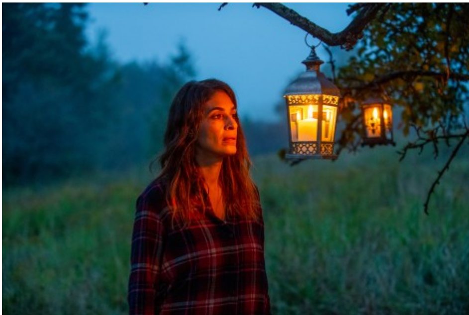
THE WISHING TREE