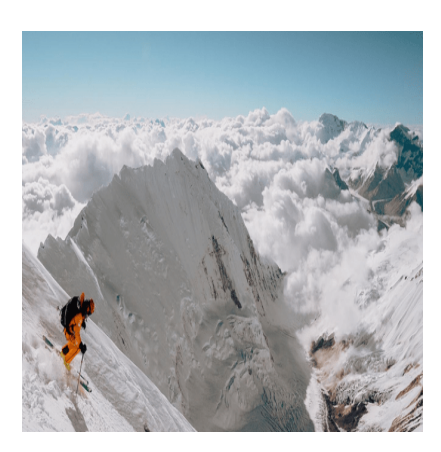
Mountainfilm Unveils 2020 Lineup of Films & Speakers