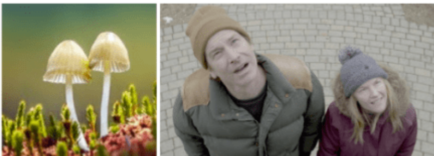
FANTASTIC FUNGI, INTERNATIONAL FALLS

Return of the one of a kind event celebrating film with special selections representing 26 film festivals in Dallas, Fort Worth, and North Texas