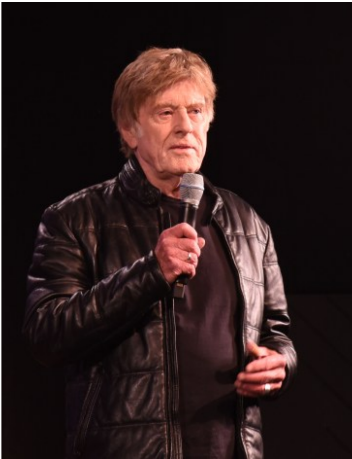
Robert Redford, President and Founder of Sundance Institute

and New Frontier Central , each of which host a variety of media installations, a VR Cinema, and panel discussions. New this year, New Frontier Central also houses the Biodigital Theatre , a cutting-edge presentation space that will feature a rotating schedule of large scale VR theatrical works including a feature-length livestream game telecast. Once again, New Frontier Central will feature lounge space for credential holders to meet and relax before and after experiencing the New Frontier program. New Frontier also breaks out into the wild with satellite projects in the pool at Festival Headquarters, AR dances to be discovered in various locations around Park City, and a nationwide “fugitive newscast” accessed at various sites around the festival, as well as at 11 art house theatres across the U.S., including The Belcourt Theatre (Nashville, Tenn.); Cinema Detroit; The Loft Cinema (Tucson, Arizona); Michigan Theater (Ann Arbor, Michigan); The Museum of Fine Arts (Houston, Texas), Nitehawk Cinema (Brooklyn, New York), Northwest Film Forum (Seattle, Washington), O Cinema (Miami, Florida), Parkway Theatre (Baltimore, Maryland), The State Theatre (Ann Arbor, Michigan) and Texas Theatre (Dallas, Texas).