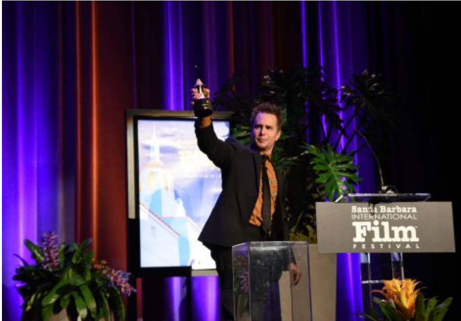
2018 American Riviera Award recipient, Sam Rockwell, holds aloft the 33rd Santa Barbara International Film Festival award.