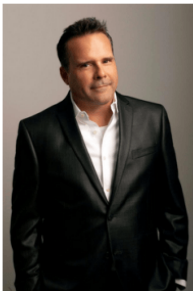
Nashville Film Festival