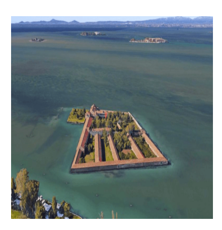
Venice dedicates entire island to VR