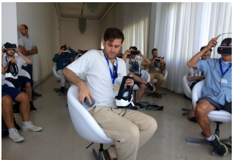
Last year the screening of several experimental films as well as the world premiere of the first feature

The members of the International Jury of the Venice Virtual Reality section are: