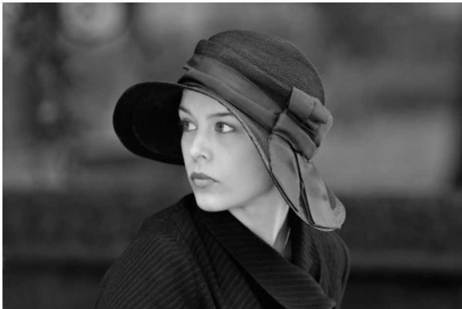
Paula Beer in Frantz.

A haunting tale of love and reconciliation begins in a small town in Germany in the immediate aftermath of World War I when a young woman mourning the death of her fiancé encounters a mysterious Frenchman laying flowers on her beloved's grave.