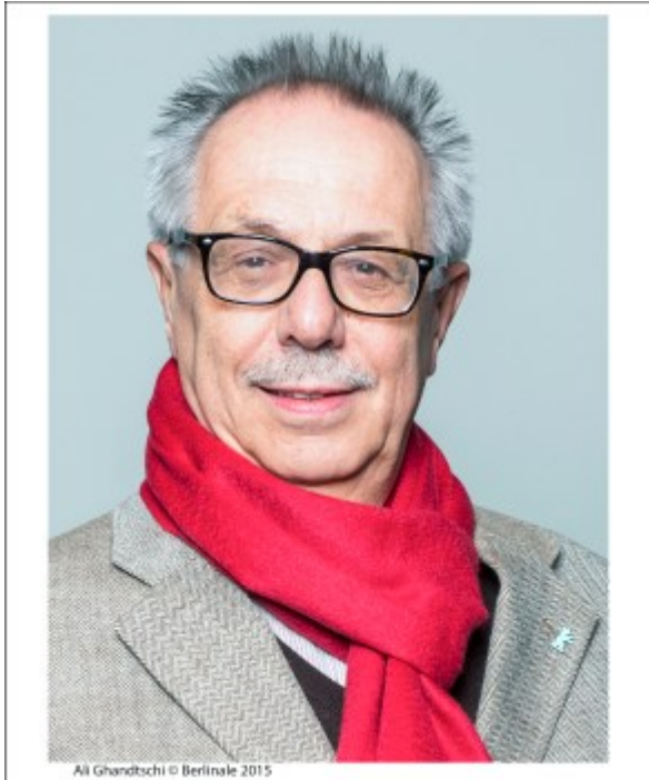
Berlinale Director Dieter Kosslick

â??Berlin is big and this year weâ??ll again follow the bear tracks to some typical spots in the capital,â?? remarks a delighted Berlinale Director Dieter Kosslick.