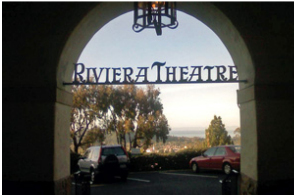
Entry way of the Santa Barbara Riviera Theater.