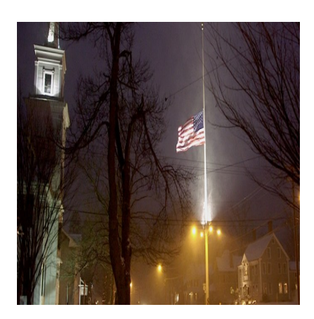
Newtown - Confronting the Sandy Hook Massacre