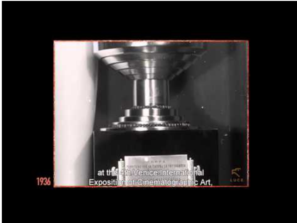
PALAZZO DEL CINEMA – PHOTO

In the film clip from the Luce Archives, summer resort images of the Lido and the description of the awards that year: “The Coppa del Duce for Best Foreign Film was won by Der Kaiser of California ( The Kaiser of California ), produced by Trenker, and the Coppa del Duce for Best Italian Film was won by Squadrone bianco ( The White Squadron ), produced by Roma Film. The Coppa Volpi for Best Actor was awarded to Paul Muni for The Story of Louis Pasteur . The Istituto Luce with Il cammino degli Eroi won the Coppa del Partito for best political and social film and the award from the National Institute for Educational Cinema for best scientific film”.