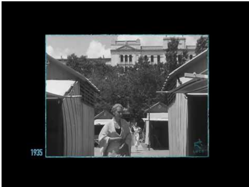
ISA MIRANDA IN VENICE – PHOTO