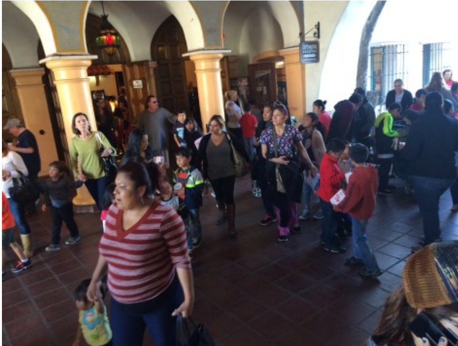
Patrons of the AppleBox Family Films at the Arlington Theater, on February 6th, 2016.

Keep in mind, it's only 364 days until the 2017 Santa Barbara International Film Festival's 32nd edition. Until then, I'll see you at the movies!